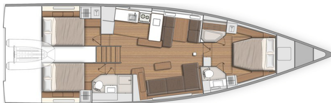
3 cabins 3 heads - Skipper's cabin version: