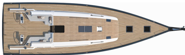
3 cabins 2 heads version: