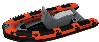
Patrol 460 w/jockey consle