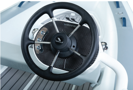
optional carbon dash pictured

Take your Classic 310 through 380 to the next level with the addition of the FCT-7 console. Designed to attach to fittings pre-built into your Classic, this is the latest version of our all-in-one seating and steering design, a helm with wheel and steering cable, and built-in navigation lights, switches for the lights, as well as the standard electric bilge pump.